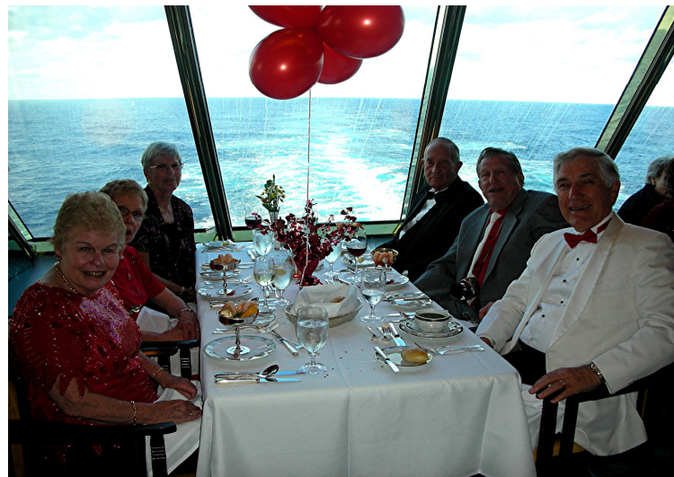
Here is the whole bunch of us at Table 119, enjoying the festive Valentine's decorations and dinner prepared for the occasion.